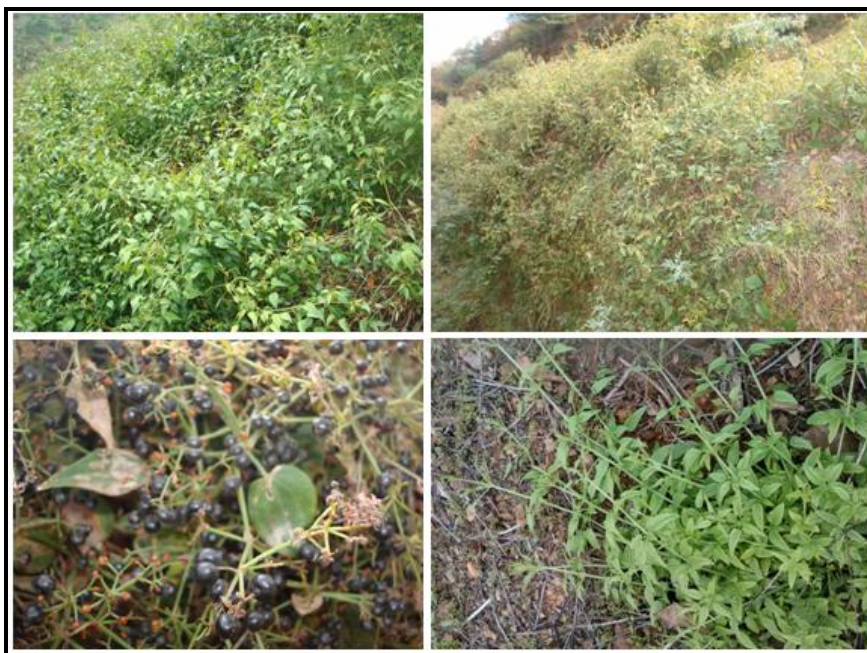
Figure 2: A. Rubia Cordifolia Near Bomdila, B. Rubia Cordifolia Near Dirang, C. Rubia Cordifolia Bearing Fruits, D. Rubia Germinating In Recently Cleared Forest

The availability of Rubia cordifolia is recorded through random transects using GPS. The transect survey is carried out mainly in the secondary forest areas along the roads or in the vicinity of the settlements. Rubia was found growing abundantly in Tenzinggaon area of Kalaktang, Shergaon, Dirang, in between Bomdila and Rupa, Palzi and Bhalukpong. In some places it has been found bearing ripened black fruits resembling cherry. Rubia proliferate vigorously in the places where forests or undergrowth are recently cleared, however, in some places it is associated with dense and moderately dense forest. A total of 97 GPS points of Rubia cordifolia was recorded in the above mentioned areas. A workshop was conducted at Domkho village to educate the villagers about the importance, vulnerability and present condition at global, national and local levels. They were also encouraged to protect and regenerate the plant.